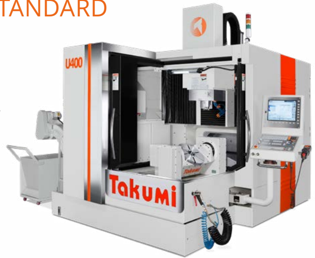
Product may differ from image