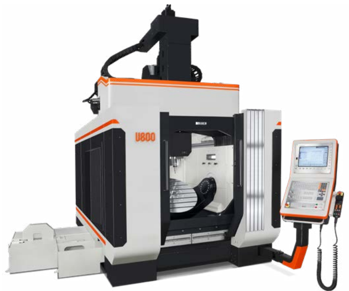
Product may differ from image