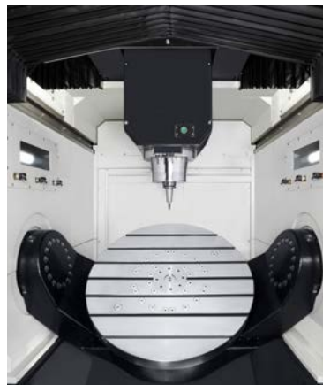
Takumi U 800: Fully enclosed working area